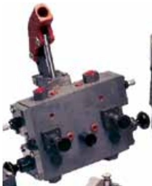
Double holding valve, speed control and hand pump assembly.